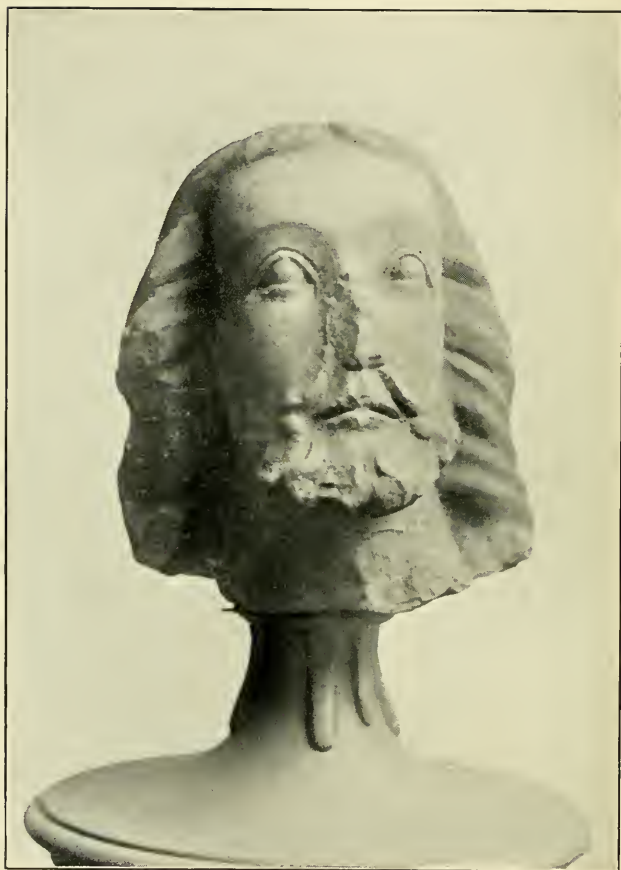
HEAD OF CHRIST. ST. ANDREWS

Excavated from the ruins of the Abbey by the late Marquis of Bute